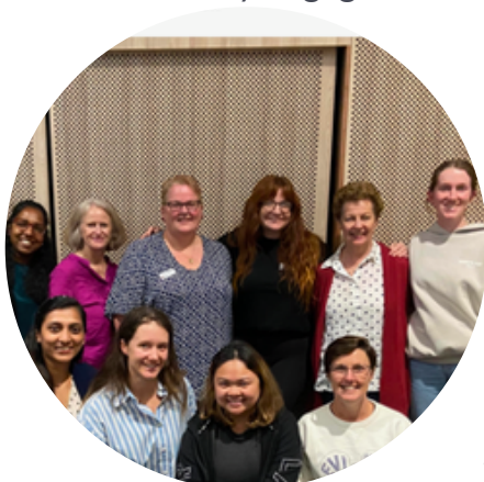
Pic: Midwives at the ACNN Babies in the Bush Wagga Wagga program in Oct 2024