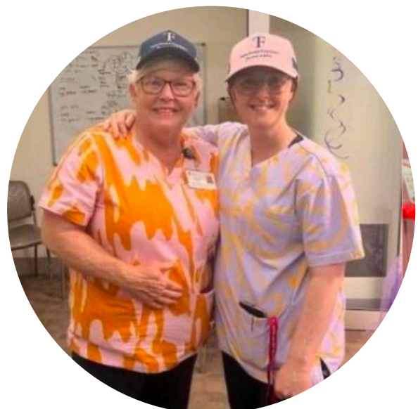
Pic: TFF acknowledged midwives on International Day of the Midwife in May 2024